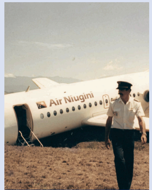
F-28 Nadzab airstrip 1997