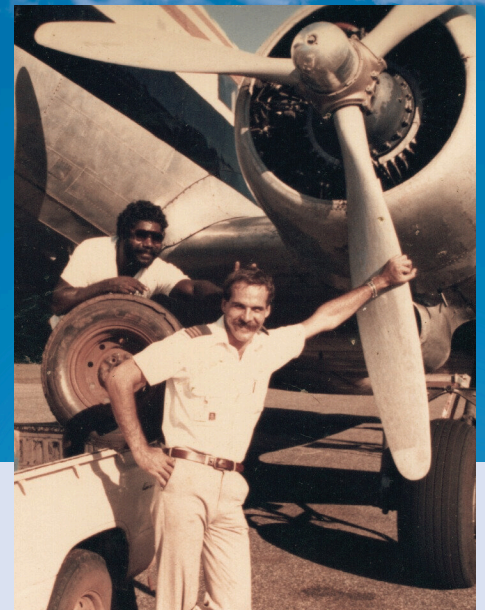
Turn-round Bathurst 1988